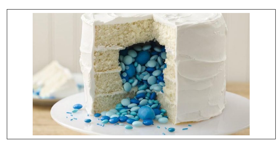
Figure 3. Surprise on the inside gender reveal cake.

it is this sense of comfort and desire for both food and the female body that is purposefully elicited by mouth-watering "food porn."