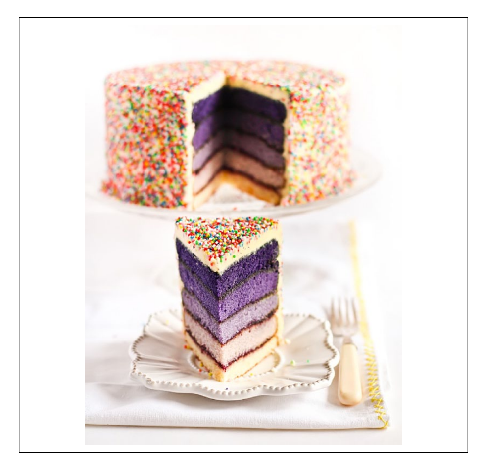
Figure 2. Purple ombré sprinkles cake.

shot" of pornography as chocolate sauces and yolks burst to life in a manner that speaks to Susan Faludi's description of the "on command male (erection) orgasm [that] is the central convention of the industry: all porn scenes should end with a visible ejaculation" (Faludi in Chan 2003, 52).