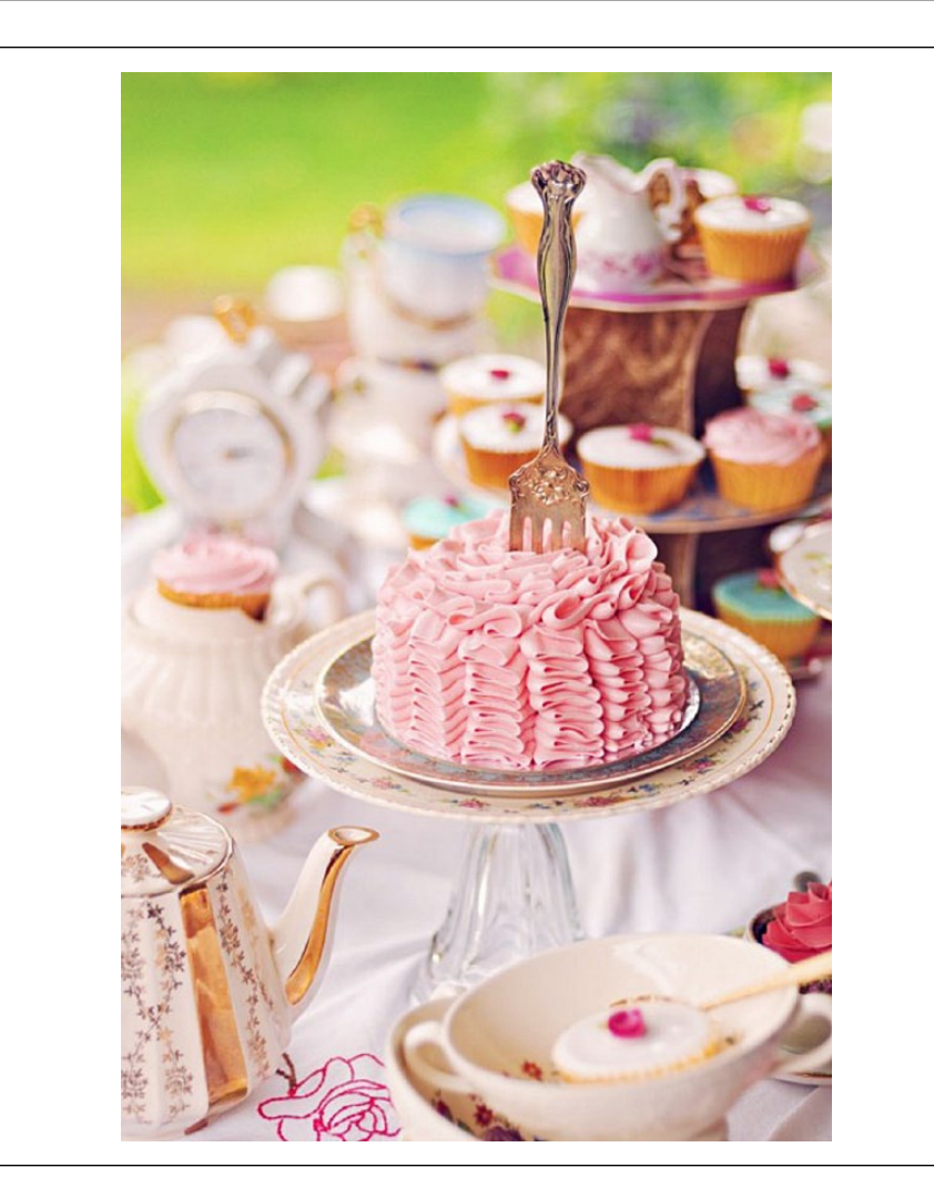
Figure 4. Ruffles and roses tea party. Source. Alyea (2011).

the food blogosphere including checkerboard cakes, ombré and rainbow tinting, and intricate, excessive layers. To fully appreciate these skills, the viewer is forced to glance inside via a cheeky and engaging photographic angle that mimics the strategic poses of the playboy centerfold who offers a thrilling, voyeuristic peek into the "flesh" of the cake. However, in "food porn," the erotic intimacy evoked by the centerfold is sublimated onto the ways that bloggers open up their private lives and domestic spaces for public scrutiny. Moreover, in the postfeminist context, the notion that creative skill and detailed attention must be applied not only to the superficial appearance of a cake