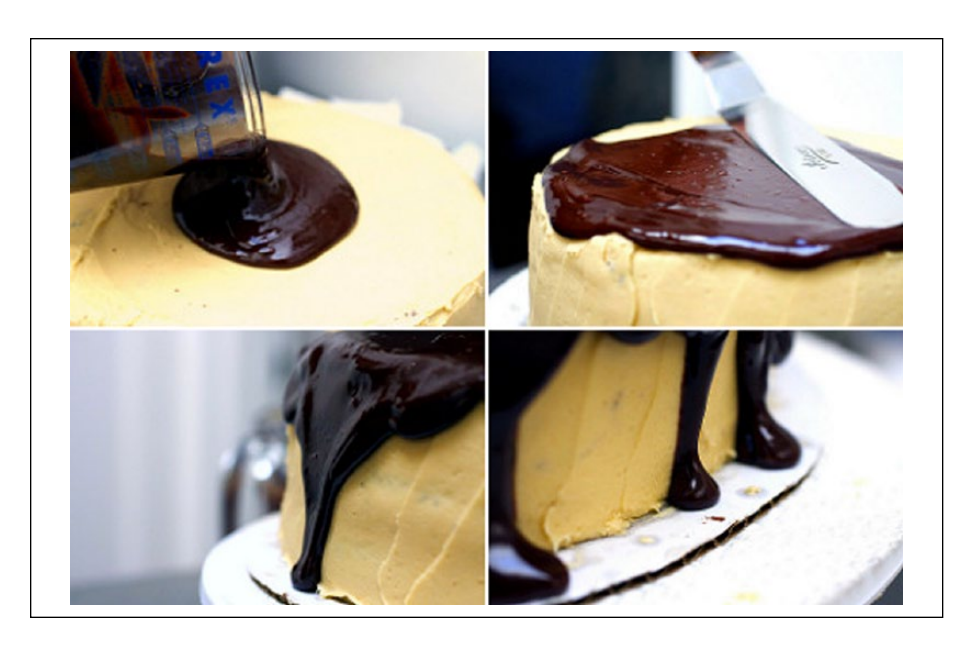
Figure 5. Chocolate peanut butter cake.

but also to its internal structure parallels the increasing penetration of self-disciplinary and self-surveillance regimes into the postfeminist subject's body and intimate life.